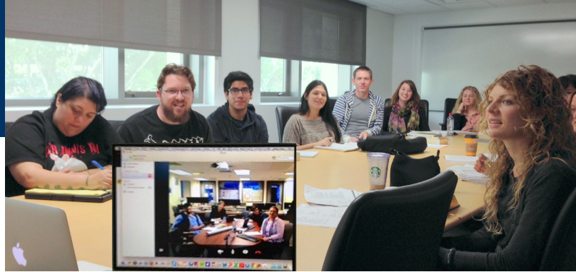
Top: San Diego State University skype with the MoEML team in the Humanities Computing and Media Centre at UVic.

Chinese Admiral Zheng He's (Cheng Ho's) early fifteenth century explorations pre-date Columbus' travels by nearly a century; the UVic-based conference examined his seven