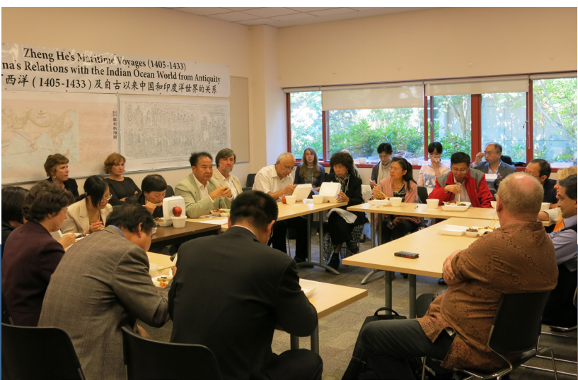
Left: CAPI hosts a lunch for conference participants.

Since its inception, SARMAC has effectively served a non-profit professional society for researchers who study the intersection between cognitive psychology and real-world applications. SARMAC is a truly international society, with substantial numbers of members based in Europe, Japan, Australia, and New Zealand.