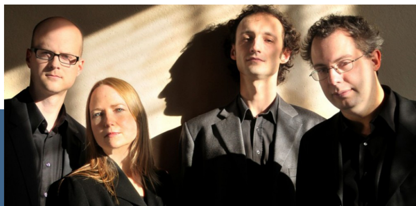
Right: Faculty of Fine Arts' Ensemble Tsilumos spent their September in a symposium abroad.

In addition to visiting classrooms, two faculty members from UVic spent time planning with faculty from UCC for an international summer institute that was co-taught by instructors from UCC and UVic. Students from both universities were enrolled in the inaugural institute in August 2014. The next institute will be held in Copenhagen in summer 2015!