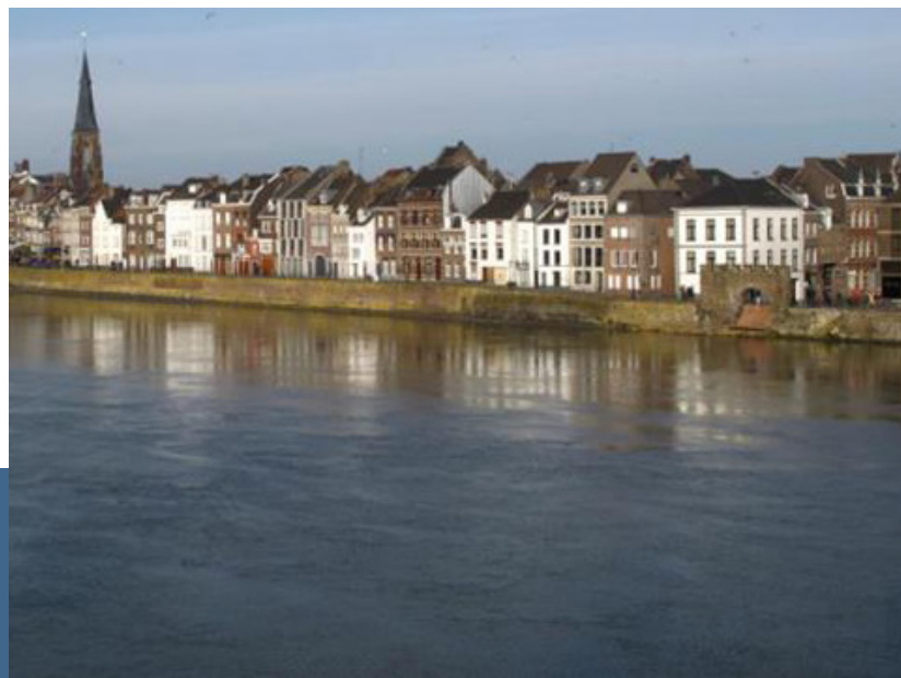
Right: A scene along the Meuse river in Maastricht, the Netherlands.

To support MGB students' academic and cultural journeys, they also learn a second language as part of the program, opening a window into truly understanding another culture and society.