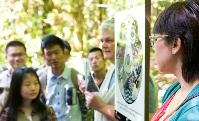
Top: A cohort of Chinese students visit UVic in July.