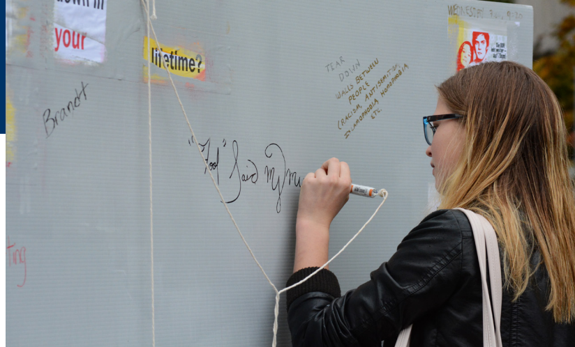
Top: A student writes on the "wall" outside McPherson Library.

An exhibit in Special Collections entitled: "Divided Germany: Commemorating the 25th Anniversary of the Fall of the Berlin Wall" with displays of texts, personal letters and other artefacts surrounding the era of the Wall is currently on display at the McPherson Library Special Collections until early March.